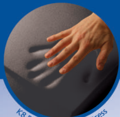
K8 Pressure Care mattress