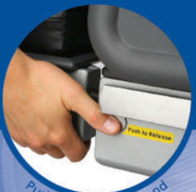
Push button release and self locking leg section