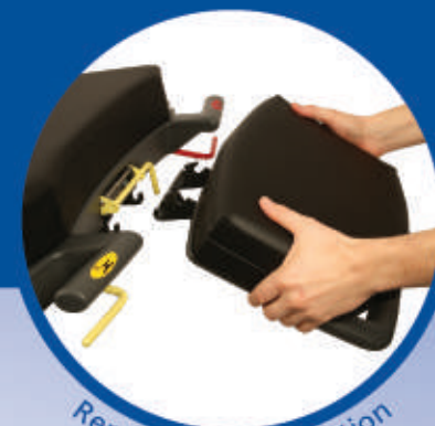
Removable head section