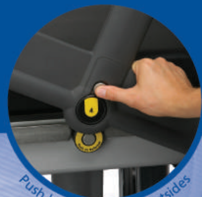
Push button rotating cotsides