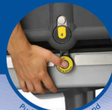
Push button release and self locking cotsides