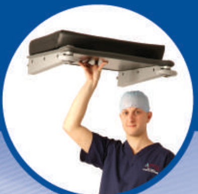
Removable ultra lightweight leg section